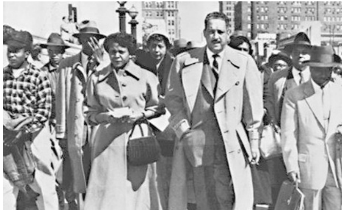
Aatherine Lucy and NAACP attorney Thurgood Marshall outside Federal Court in Birmingham, Ala., during her struggle to integrate the University of Alabama in February of 1956. She courageously sacrificed for all students of color to attend.

"The good news is that we have made gains and we will continue to make gains, but the reality is that we have to fight to make these gains," he said. "No matter what the barrier is, we have to be prepared to clear it."