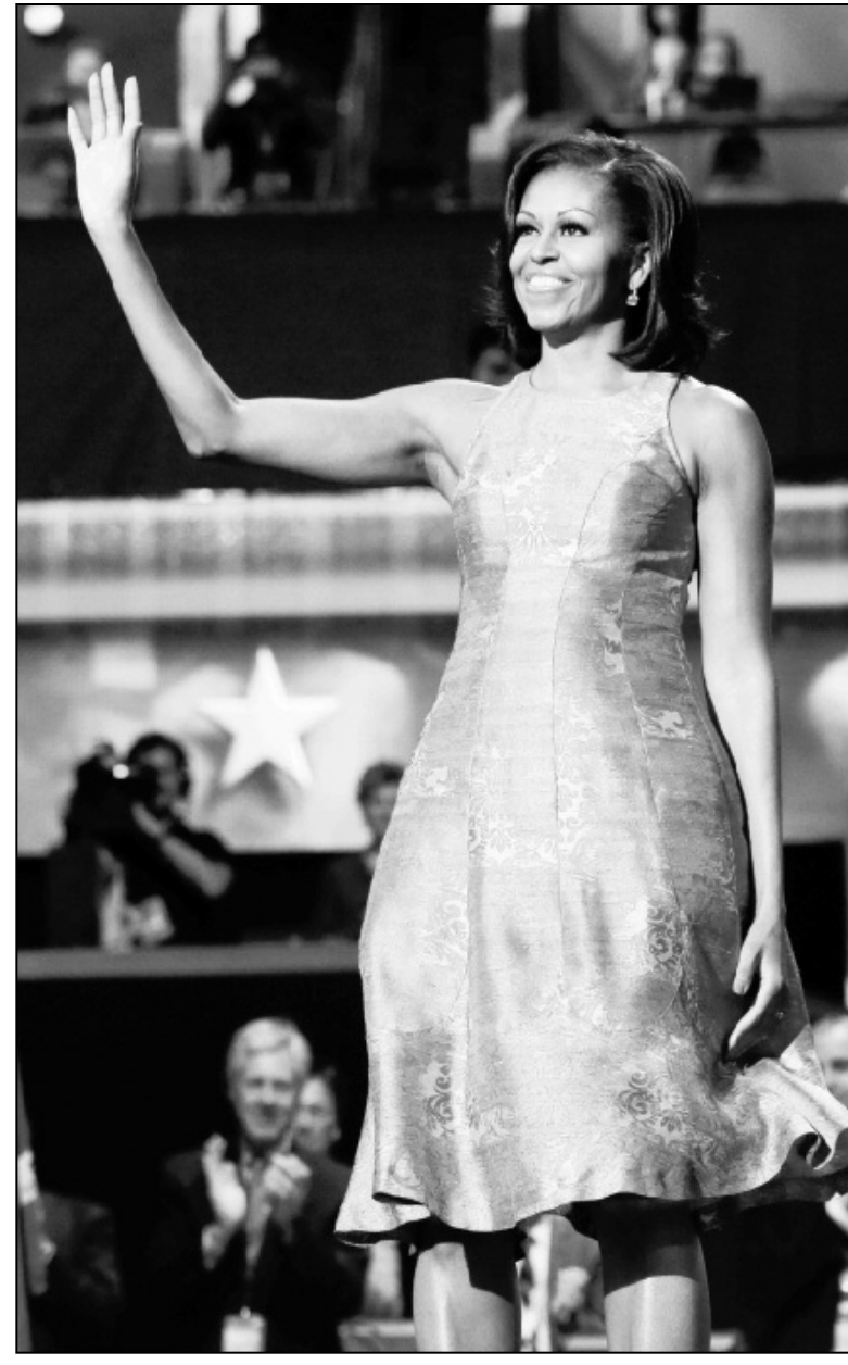
FIRST LADY MICHELLE OBAMA

"He has seen firsthand that being president doesn't change who you are. It reveals who you are," she said. "So in the end, for Barack, these issues aren't political—they're personal. Because Barack